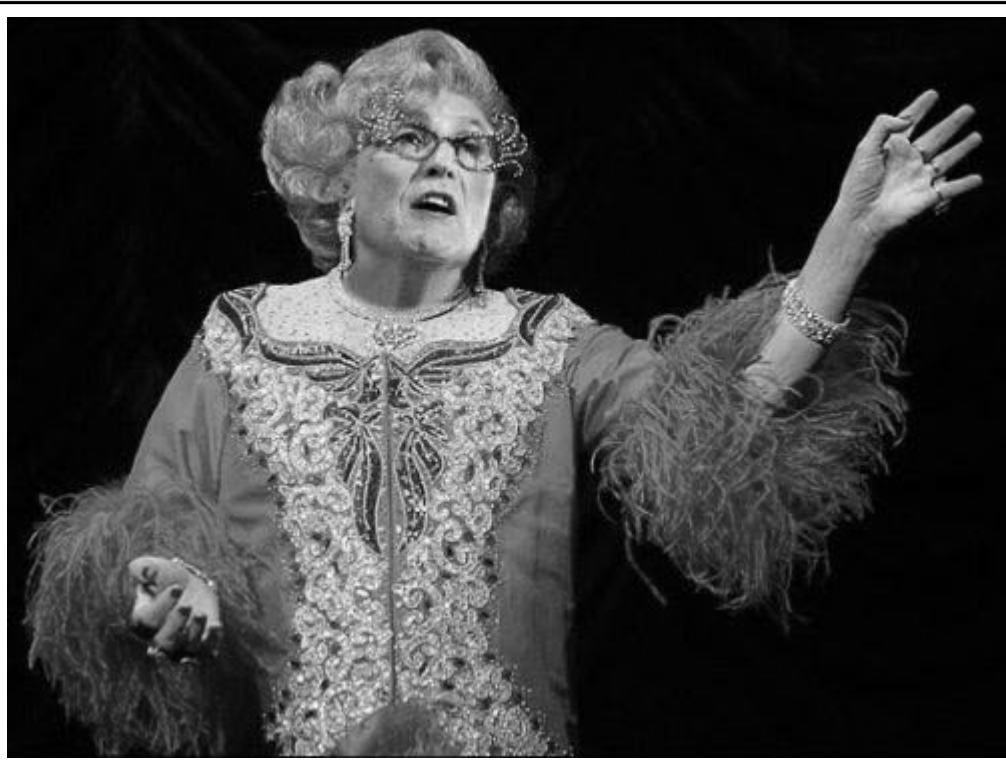
Rudy Giuliani dressed in drag.

Also, it is essential that Christians realize that it is not the duty of government to make the culture Christian, nor could government do so. That is the duty of Christians. Jesus said, “Ye are the salt of the earth: but if the salt have lost his savour, wherewith shall it be salted? it is thenceforth good for nothing, but to be cast out, and to be trodden under foot of men” (Mat. 5:4). Salt is a preservative, but if it has lost its saltiness it is worthless. A Christian who has lost his Christlikeness is also worthless—he or she will either have no influence or bad influence. Were Jesus in the USA today, He would not be sitting on a couch watching immoral TV shows while the world goes to Hell. He would read His Bible and pray every day. He would set aside lots of time every week to evangelize. He would make time to minister to individual people. Nothing—absolutely nothing—will take the place of visiting people in their homes, making friends with them, living a holy life before them, telling them what a difference Christ has made in your life and can make also in their lives, and presenting the Gospel to them. Light drives away darkness. Present the light of the Gospel to the world, and the humanists will run like cockroaches back into their holes.