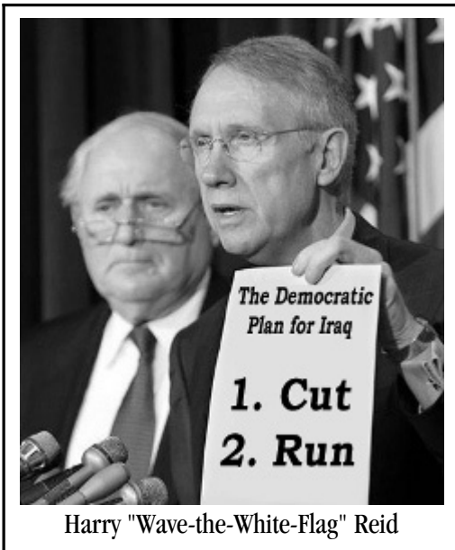
Harry "Wave-the-White-Flag" Reid

On Thursday September 27, 2007, Hillary Clinton's Media Matters for America falsely claimed on its web site that "during the September 26 broadcast of Rush Limbaugh's nationally syndicated radio show, he called service members who advocate U.S. withdrawal from Iraq "phony soldiers." 20