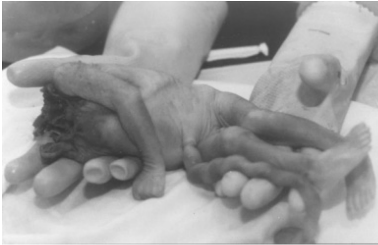
This is what the Democrat Party and Humanism stand for.